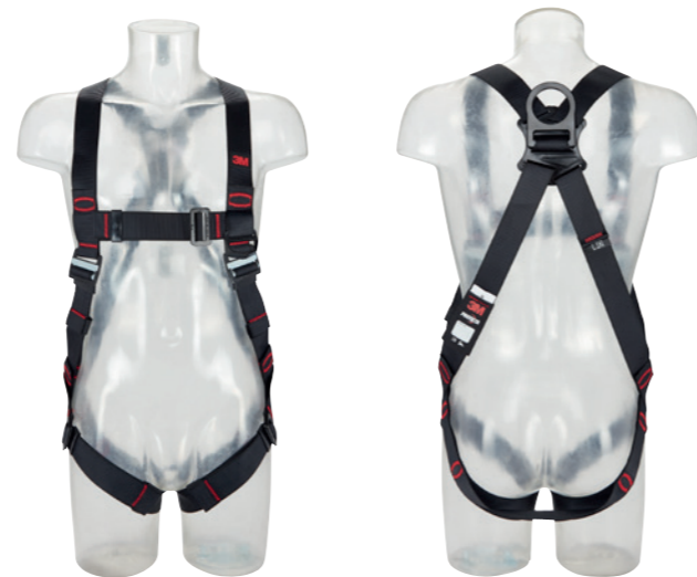
3M™ Protecta® Standard Vest Style Fall Arrest Harness