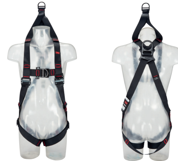
3M™ Protecta® Standard Vest Style Fall Arrest Rescue Harness