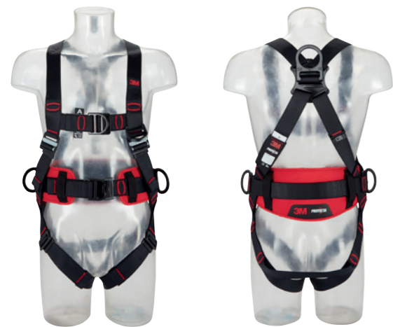
3M™ Protecta® Comfort Belt Style Fall Arrest Harness