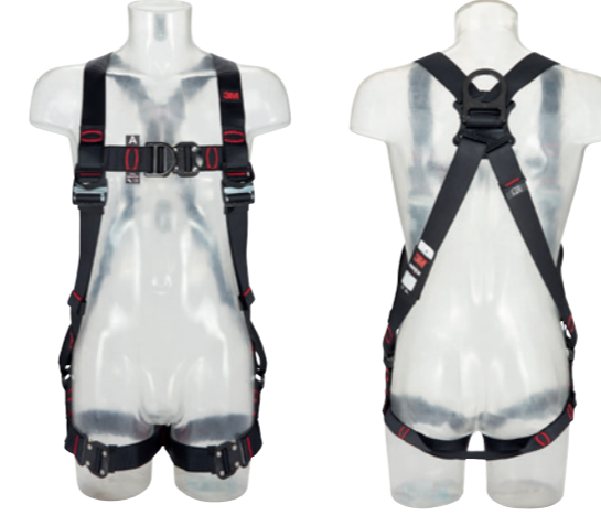
3M™ Protecta® Standard Vest Style Fall Arrest Harness with Horizontal Leg Straps