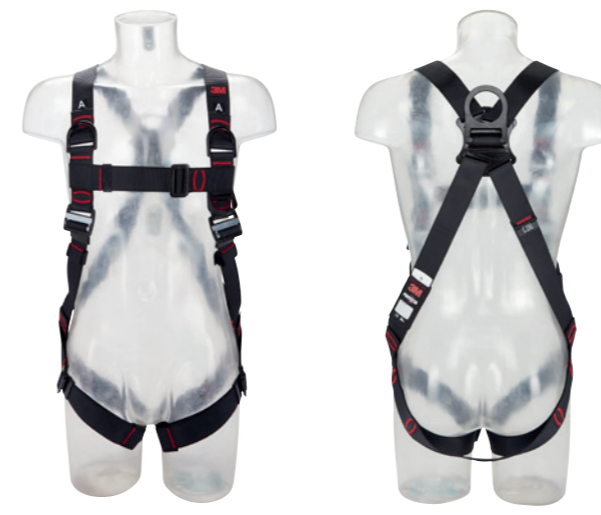
3M™ Protecta® Standard Vest Style Fall Arrest Harness