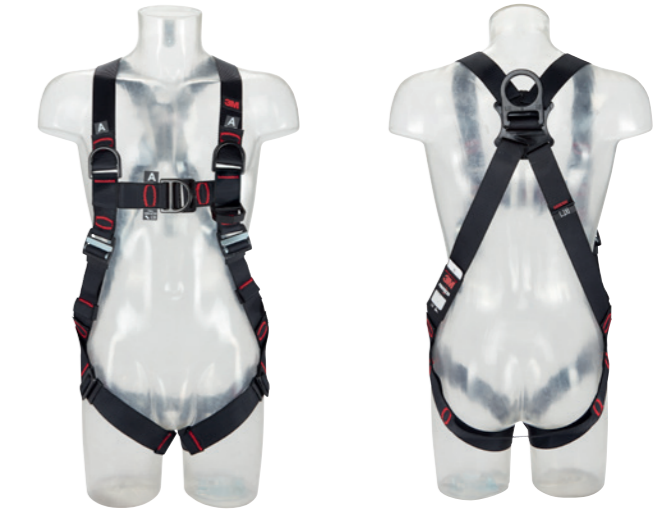
3M™ Protecta® Standard Vest Style Fall Arrest Harness