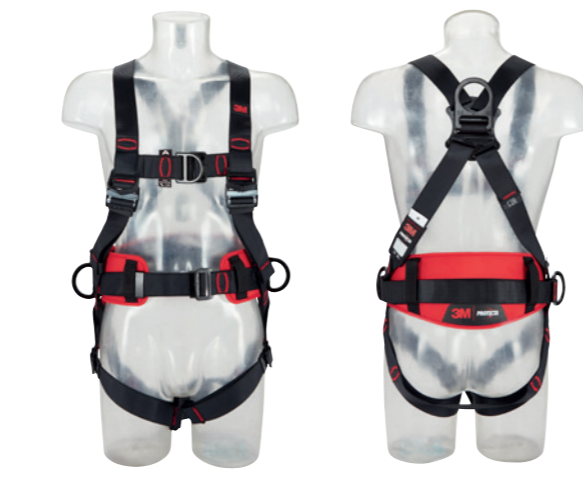
3M™ Protecta® Comfort Belt Style Fall Arrest Harness