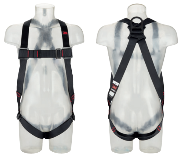
3M™ Protecta® Standard Vest Style Fall Arrest Harness