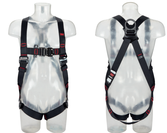
3M™ Protecta® Standard Vest Style Fall Arrest Harness