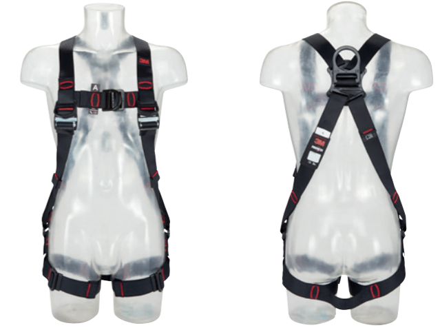
3M™ Protecta® Standard Vest Style Fall Arrest Harness with Horizontal Leg Straps