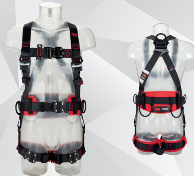
Comfort belt, horizontal leg straps