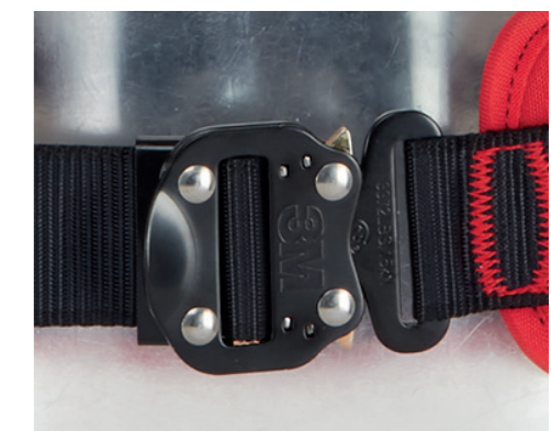
Quick connect buckles