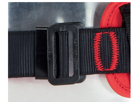
Pass through buckles