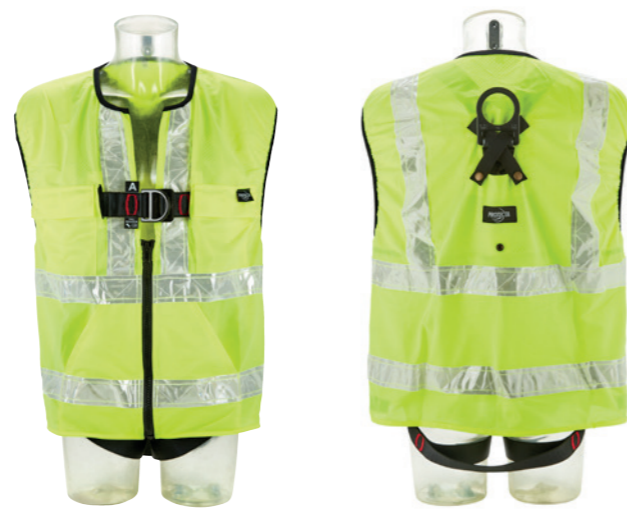
3M™ Protecta® Standard Vest Style Fall Arrest Harness with Hi-Visibility Vest