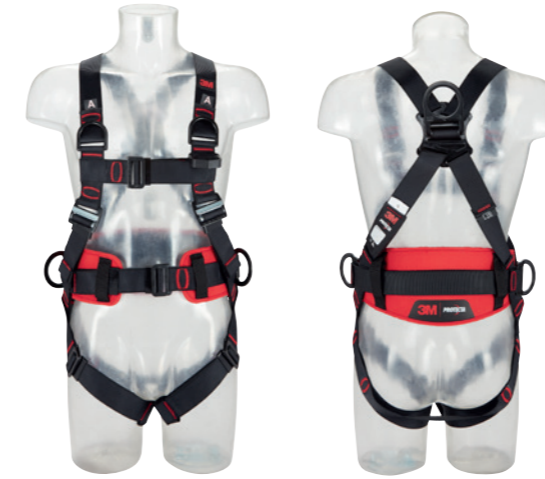
3M™ Protecta® Comfort Belt Style Fall Arrest Harness