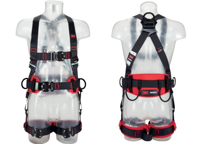
3M™ Protecta® Comfort Belt Style Fall Arrest Harness with Horizontal Leg Straps