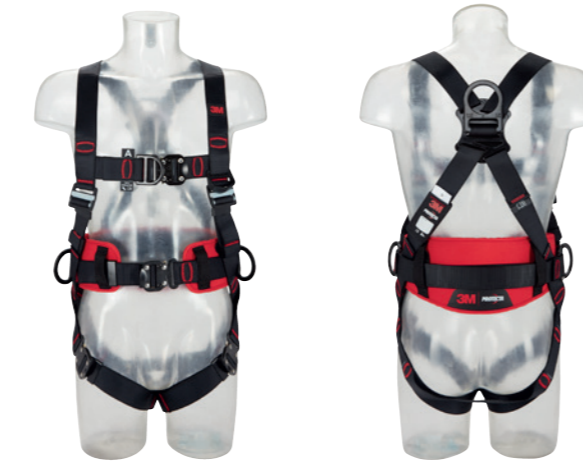
3M™ Protecta® Comfort Belt Style Fall Arrest Harness