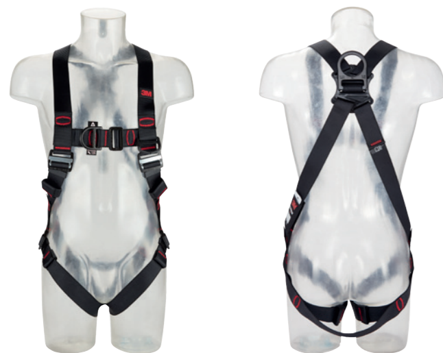
3M™ Protecta® Standard Vest Style Fall Arrest Harness